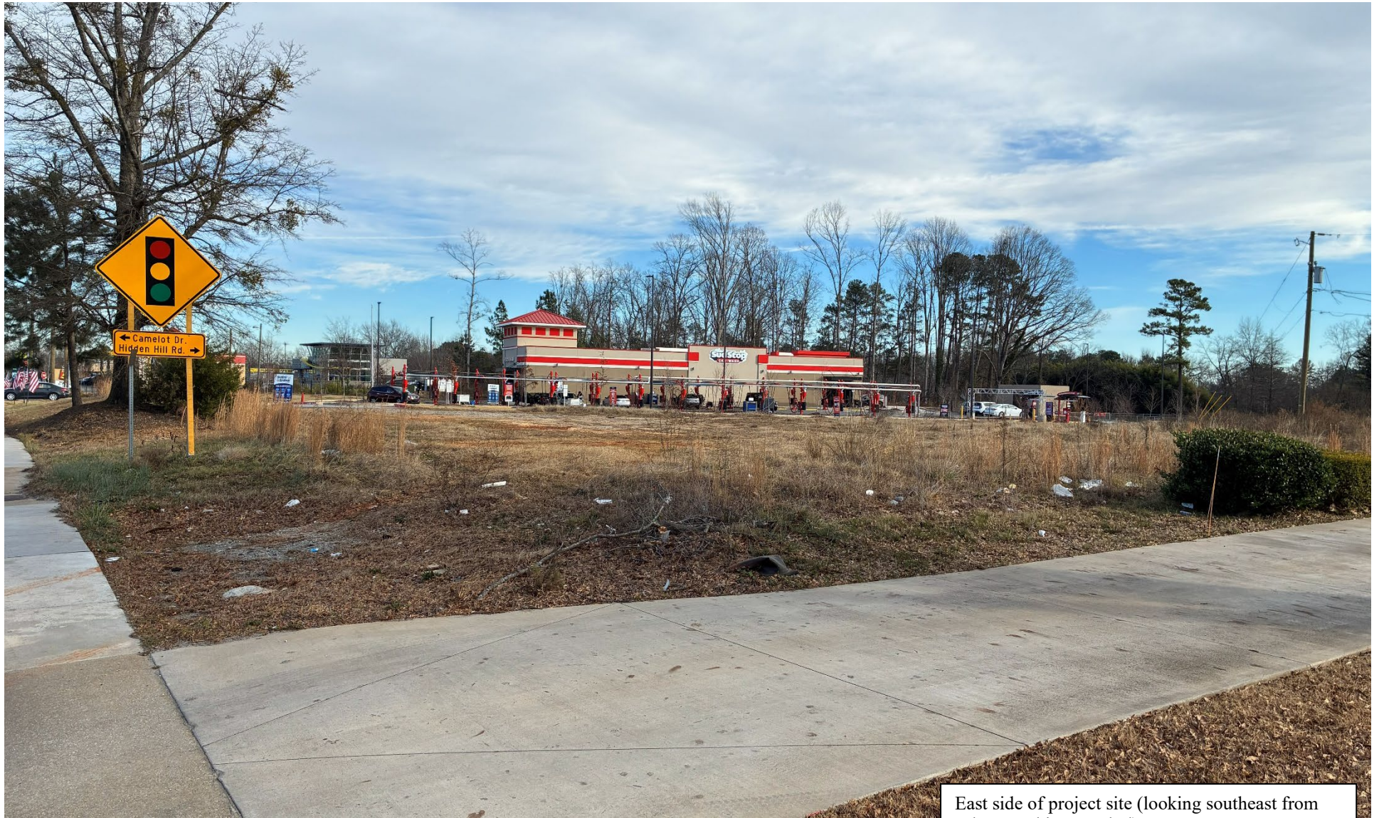
East side of project site (looking southeast from John B. White Sr. Blvd)