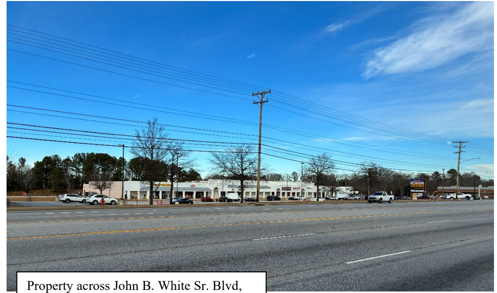
Property across John B. White Sr. Blvd, looking northeast from project site.