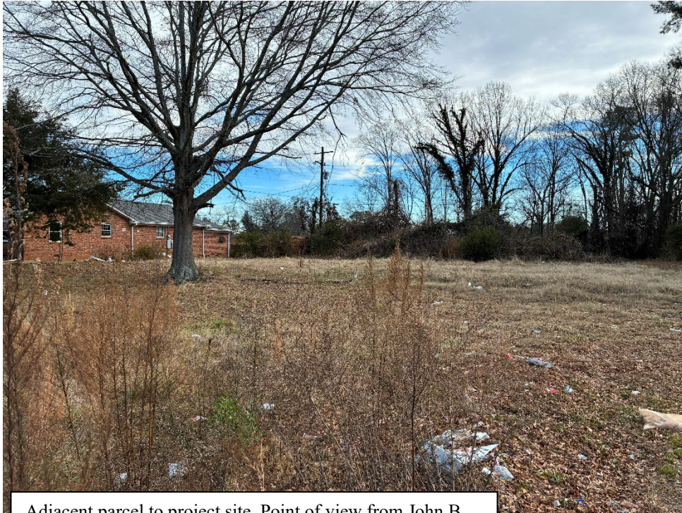
Adjacent parcel to project site. Point of view from John B. White Sr. Blvd, looking southeast.