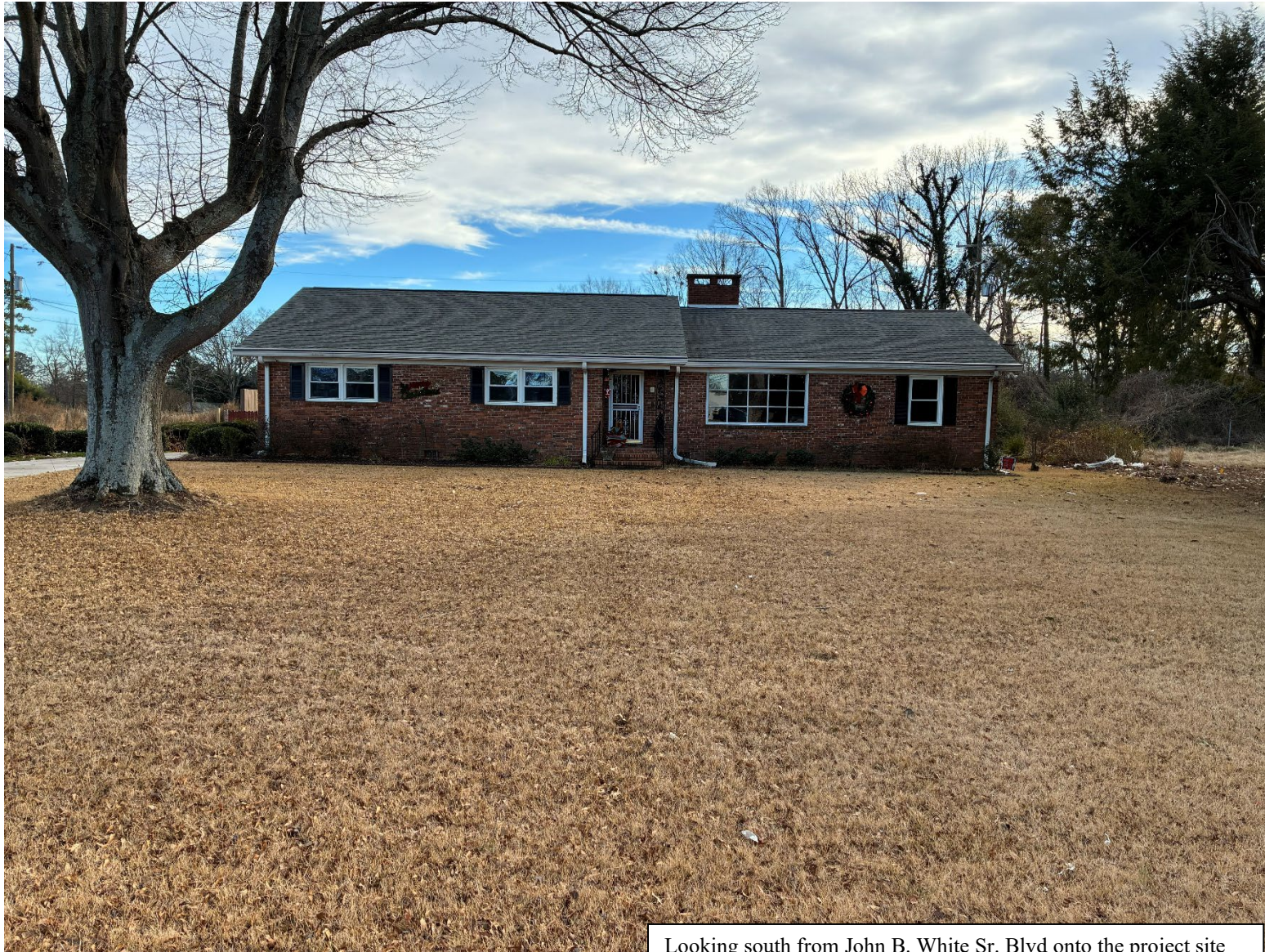
Looking south from John B. White Sr. Blvd onto the project site