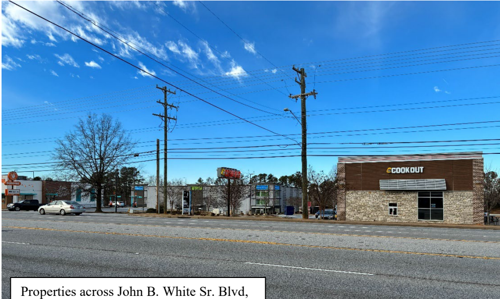
Properties across John B. White Sr. Blvd, looking north from project site.