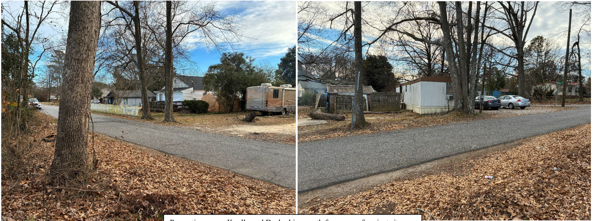
Properties across Knollwood Dr, looking south from rear of project site.