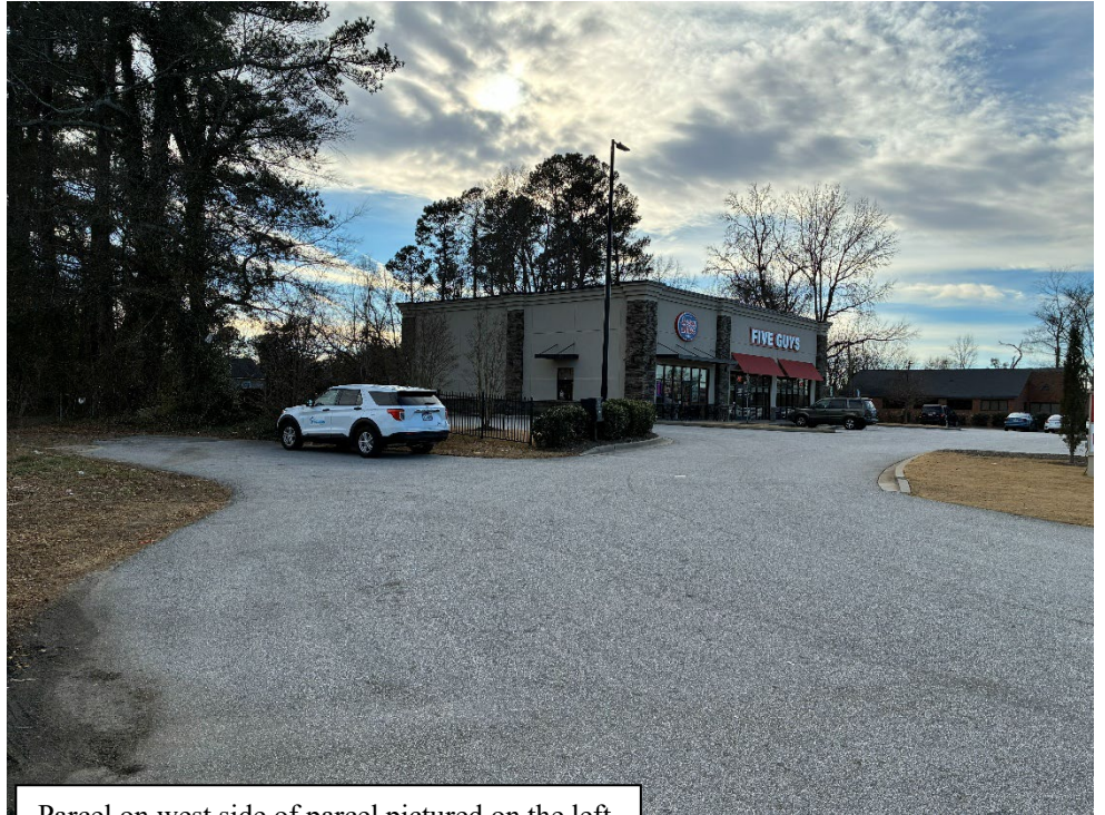
Parcel on west side of parcel pictured on the left.