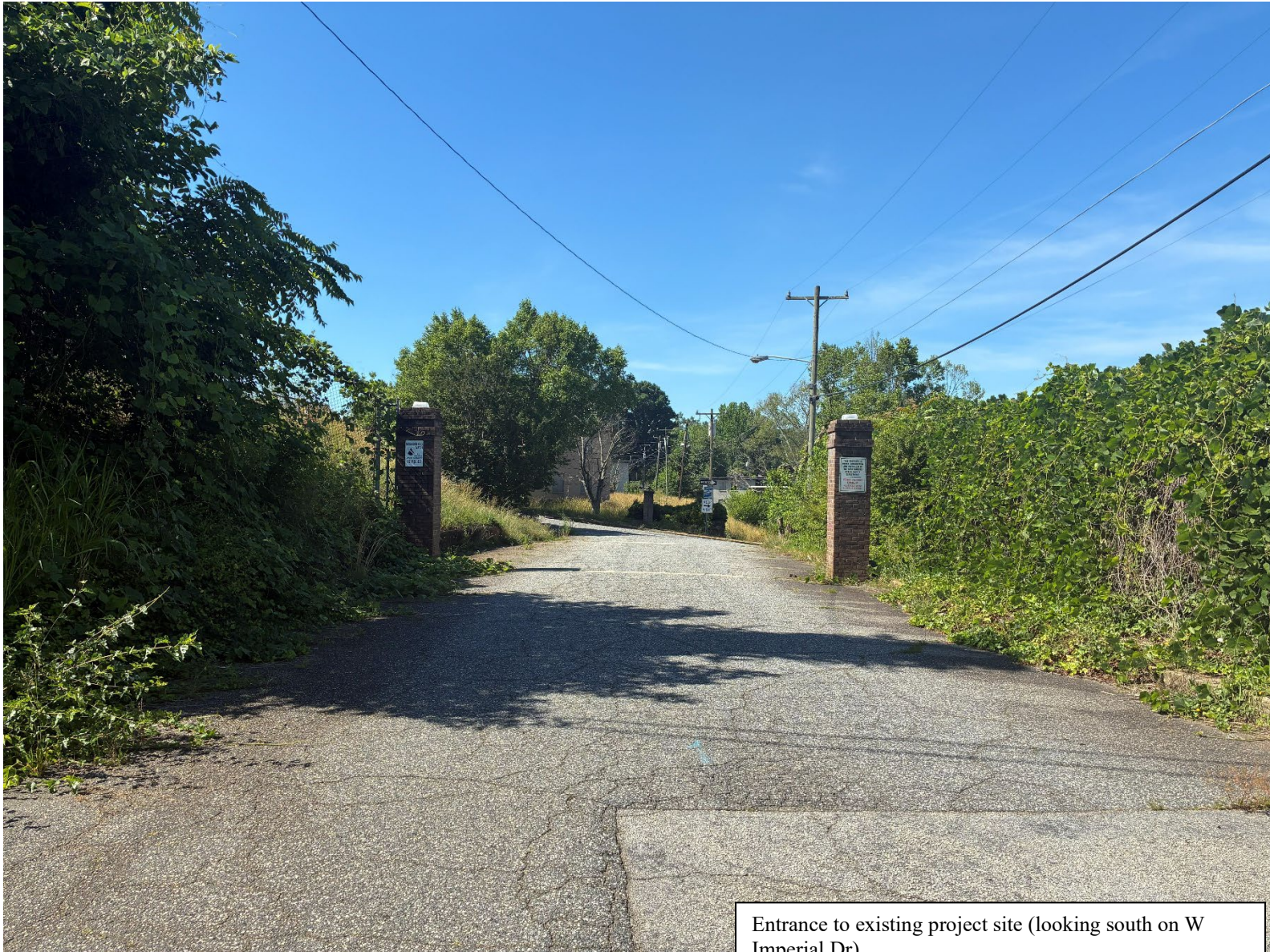
Entrance to existing project site (looking south on W Imperial Dr).