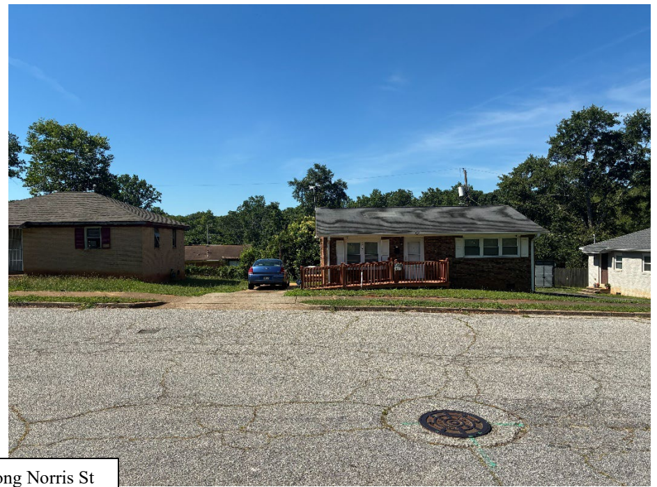
Residential properties along Norris St