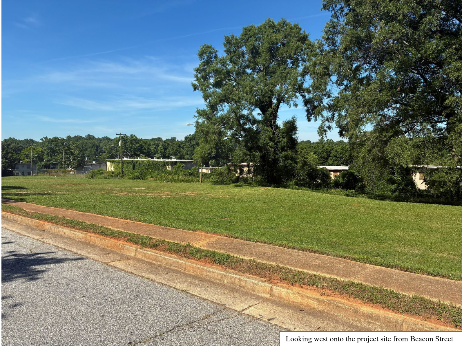
Looking west onto the project site from Beacon Street