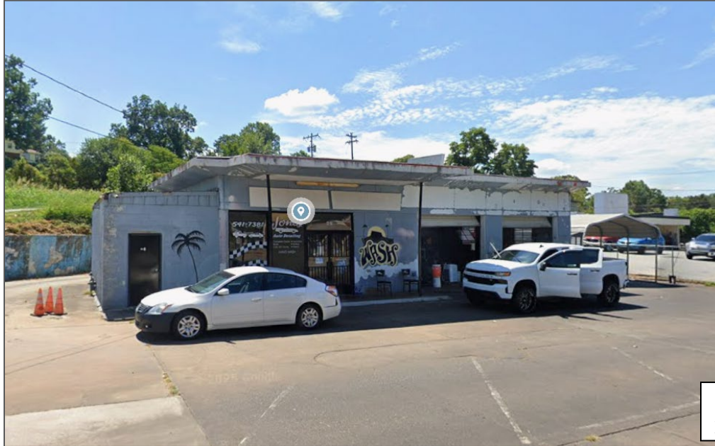
Commercial properties on the north side of the project site along John B. White Sr. Blvd.