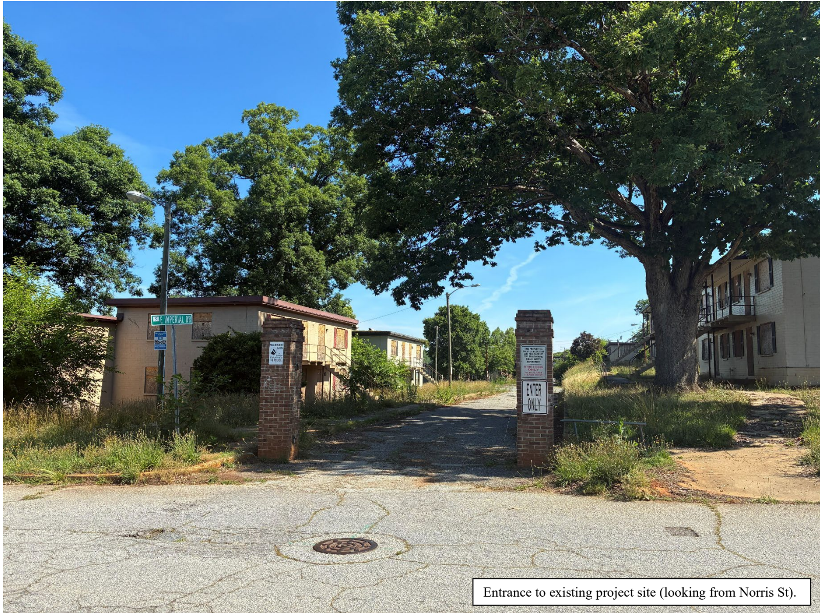
Entrance to existing project site (looking from Norris St).